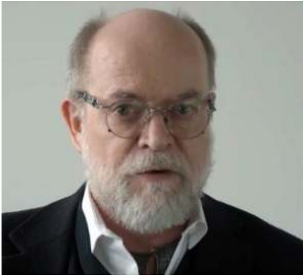
Dr Knut M. Wittkowski

Public Health England (PHE) disagreed with ICL's evidence free assumptions and downgraded COVID 19 from a High Consequence Infectious Disease (HCID), due to relatively low mortality rates.