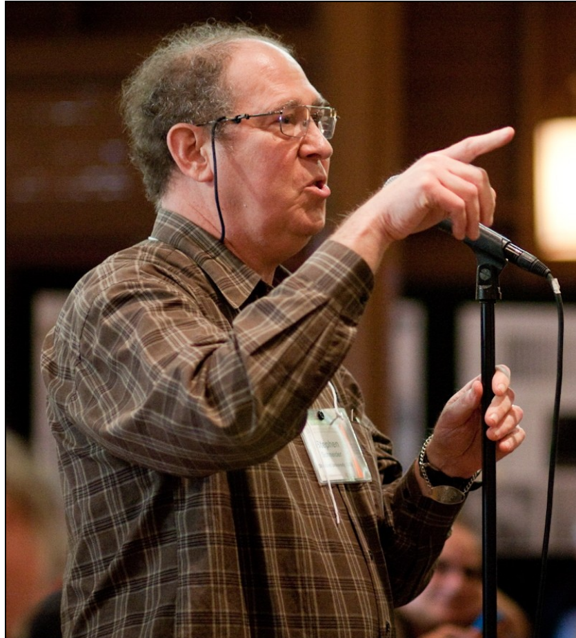
Dr. Stephen Schneider (1945 - 2010)

Our colleague and friend, who dedicated his professional career to increasing understanding and communicating how human activities are affecting the climate, the environment, and society— and how we all can make the world a better place