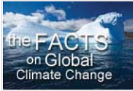
Facts on Global Climate Change

Return to top | RSS Feeds | What is RSS? | Sitemap | Contact Us | Tell Your Member