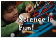
Science is Fun!