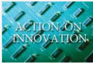
Action on Innovation