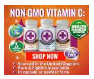
Advertise with NaturalNews.